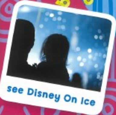
see Disney On Ice