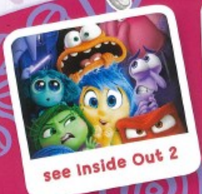
see Inside Out 2