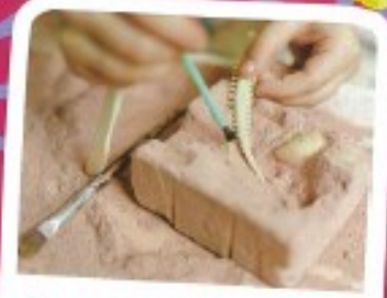
dino dig discovery